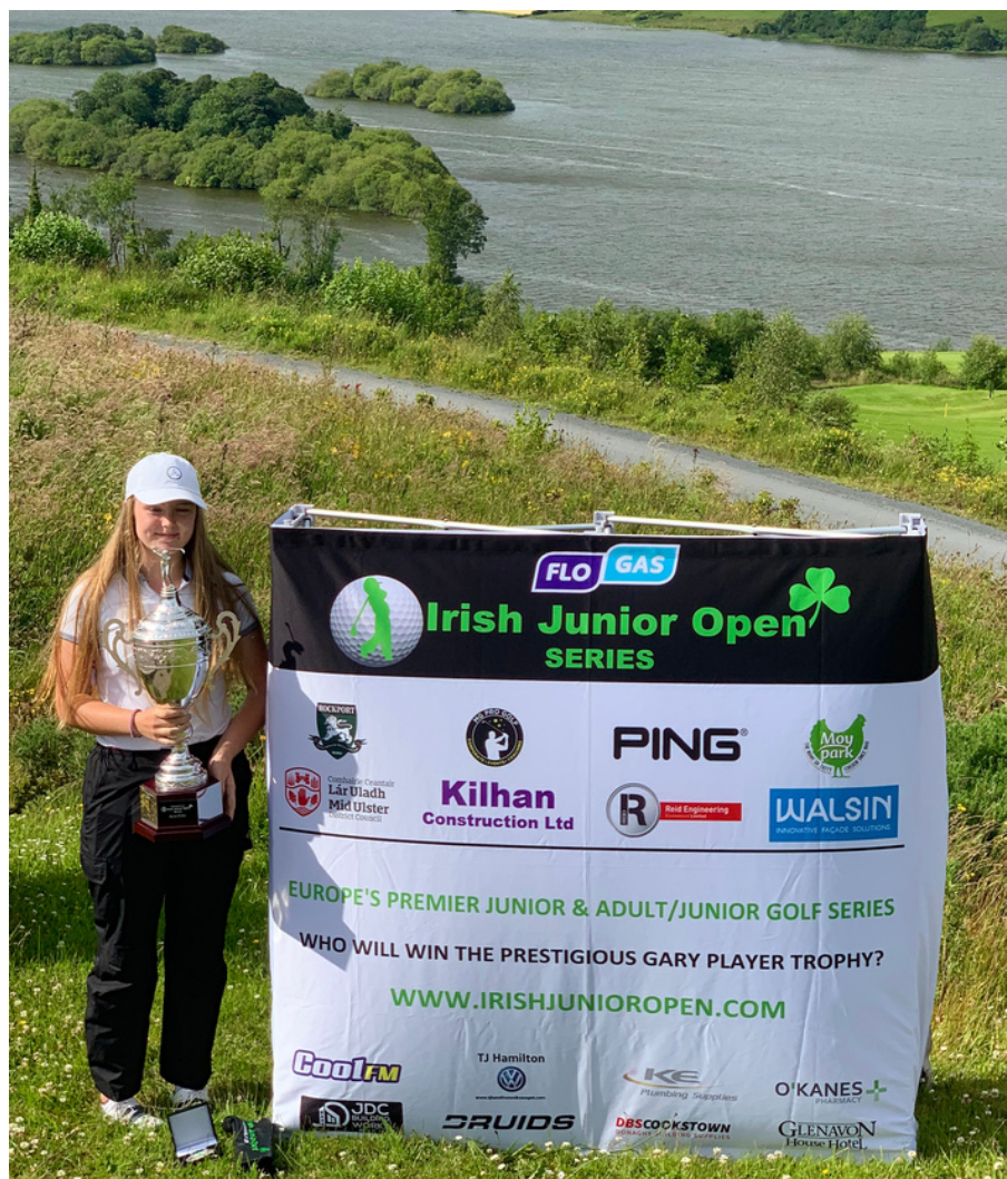
PRIZE WINNERS SPONSORS ADVERTISING