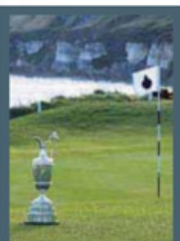
2019 OPEN COURSE Magnificent Royal Portrush