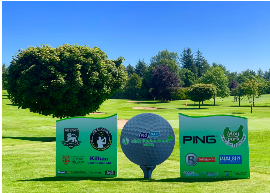
1ST TEE SPONSORS ADVERTISING